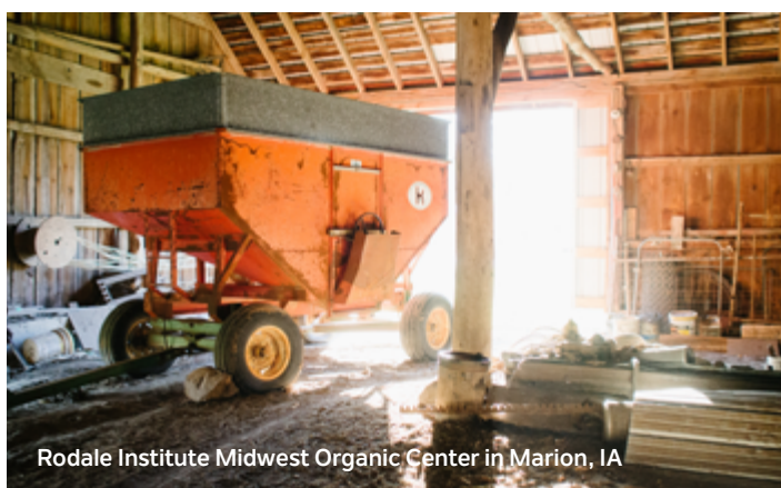
Rodale Institute Midwest Organic Center in Marion, IA

Located on a former cheese house, this Center will establish long-term research trials, as well as study cover crop options for organic corn, livestock integration, and organic vegetable production.