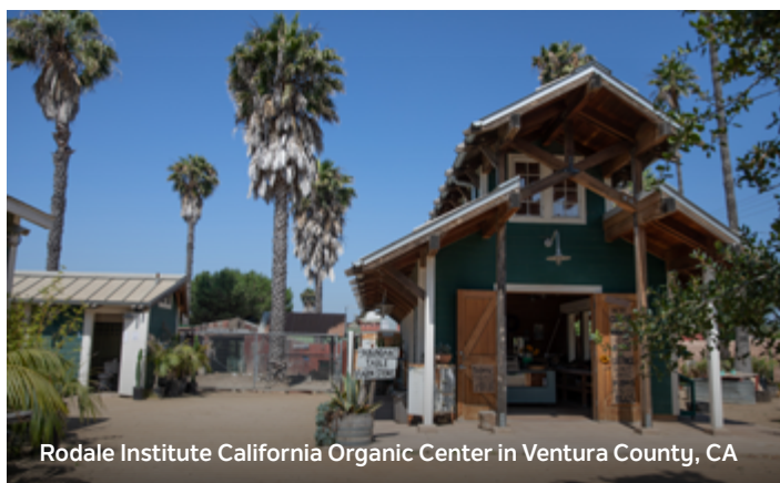
Rodale Institute California Organic Center in Ventura County, CA

The heart of Rodale Institute's organic crop consulting program in the Midwest. Current research trials include cover crop water usage, soil respiration, pest detection, soil health recovery, and improving plant growth.