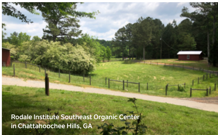
Rodale Institute Southeast Organic Center in Chattahoochee Hills, GA

Rodale Institute's Regional Resource Centers serve as research and education hubs in U.S. agricultural hotspots, aimed at providing tailored science and programming to farmers across the country.