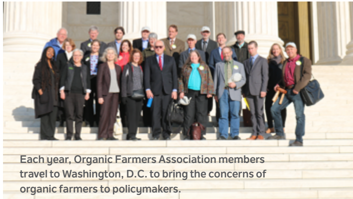
Each year, Organic Farmers Association members travel to Washington, D.C. to bring the concerns of organic farmers to policymakers.